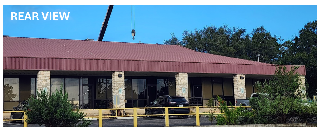
APPENDIX A, PAGE 3 CITY OF JONESTOWN, TEXAS