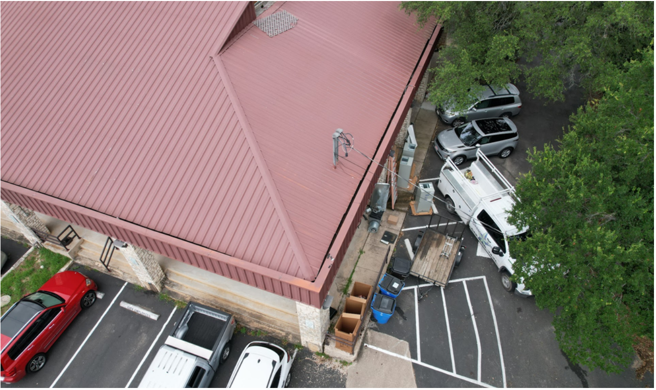
APPENDIX A, PAGE 1 CITY OF JONESTOWN, TEXAS