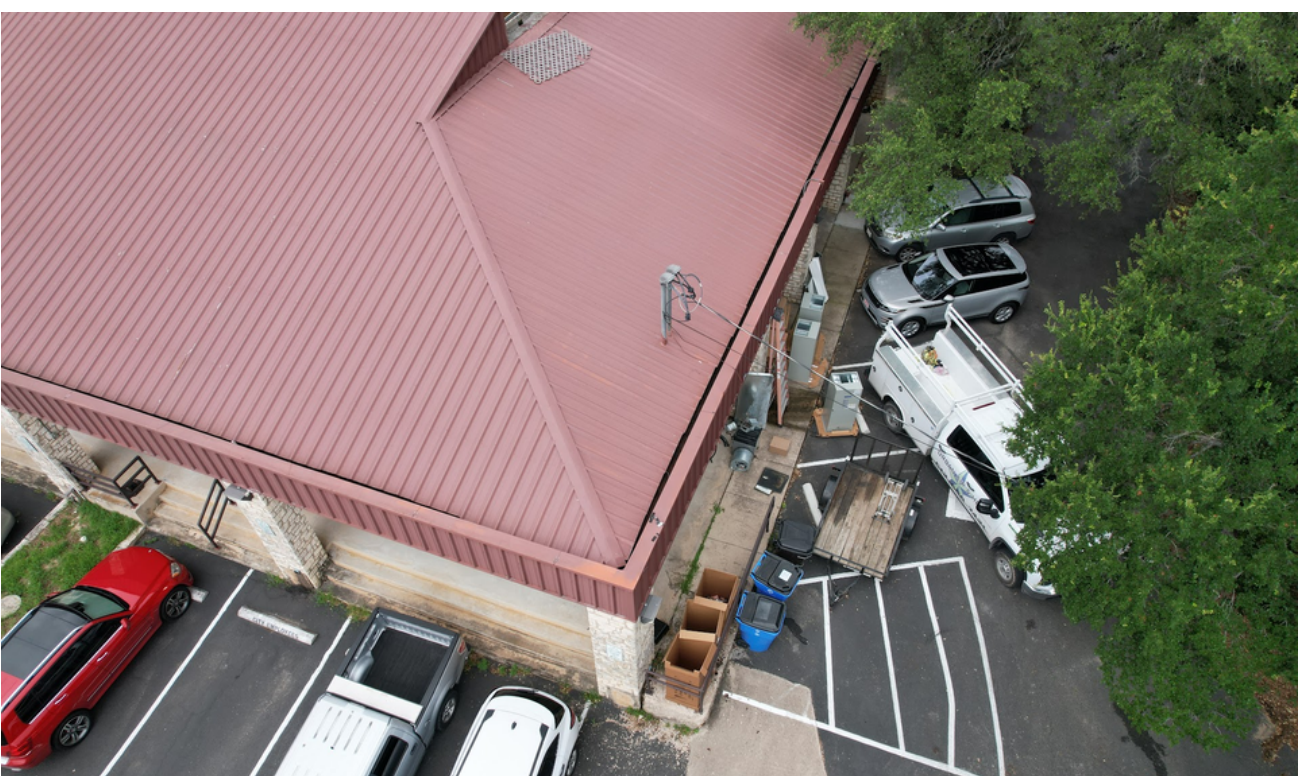
APPENDIX A, PAGE 1 CITY OF JONESTOWN, TEXAS